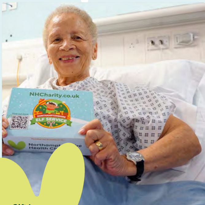
Gift boxes spreading joy, thanks to you!